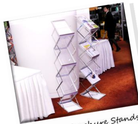
Sponsor Brochure Stands

2017 Sponsors received Marketing exposure from industry Media outlets with a combined circulation of over 200,000!