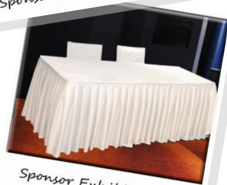
Sponsor Exhibit Area

FOR MORE INFORMATION ABOUT SPONSOR BENEFITS, PLEASE CONTACT: